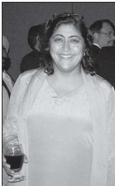
Gurinder Chadha's movie 'Acting Our Age' drew laughter at the festival.