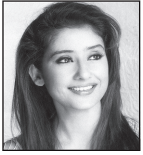
Manisha Koirala (2009)