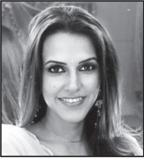
Neha Dhupia (2006)