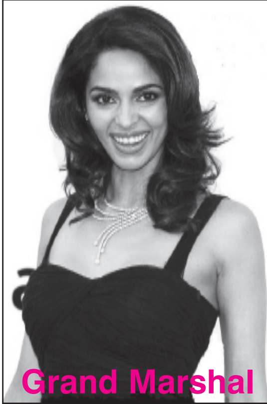
Grand Marshal Mallika Sherawat