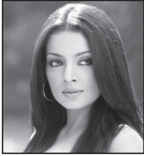
Celina Jaitley (2007)